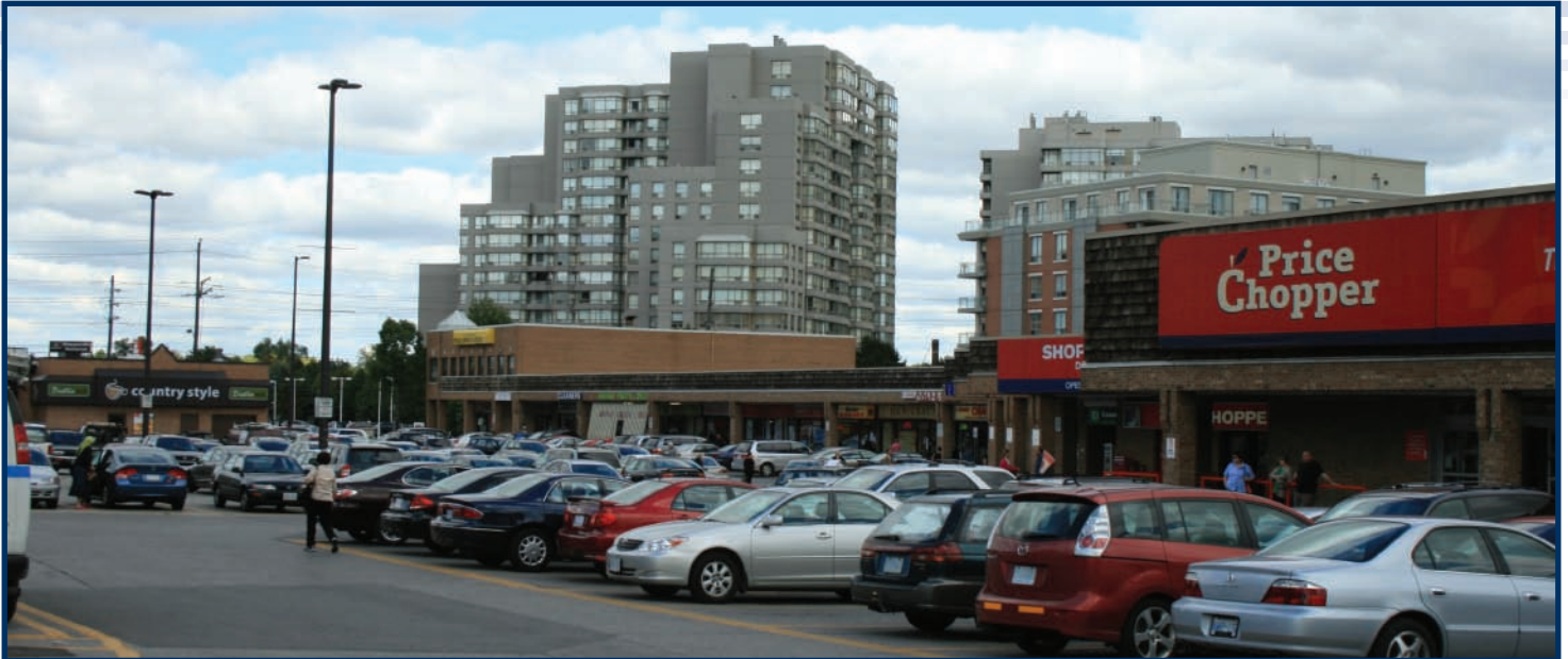
BATHURST STEELES SHOPPING CENTRE, 6201-6257 Bathurst Street, Toronto, Ontario