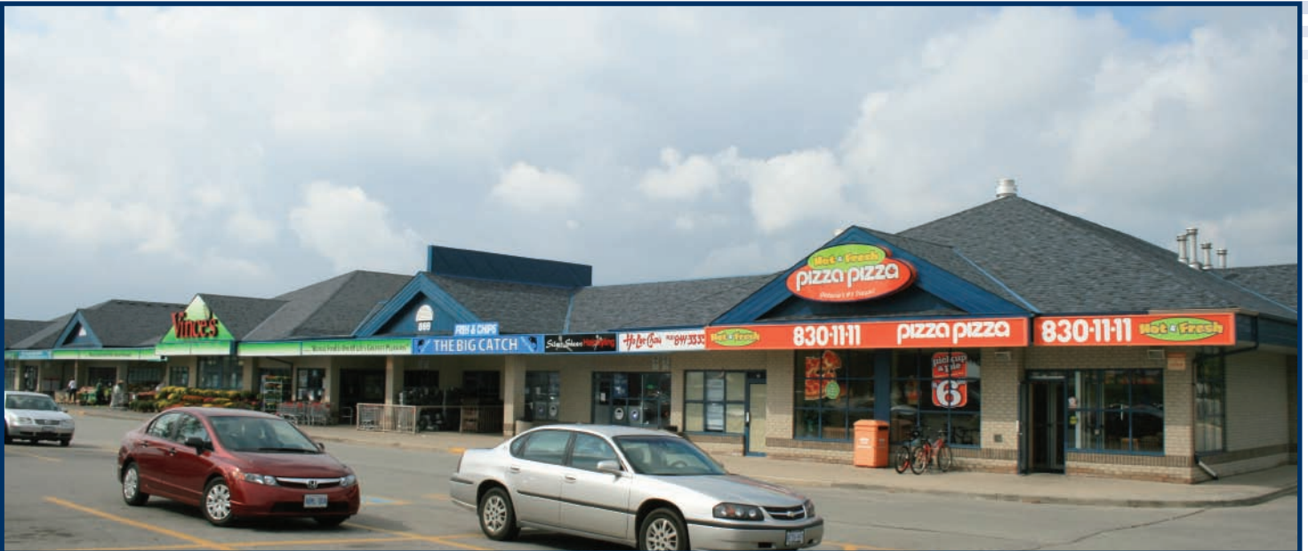
COLLEGE MANOR SHOPS, 855-883 Mulock Drive, Newmarket, Ontario