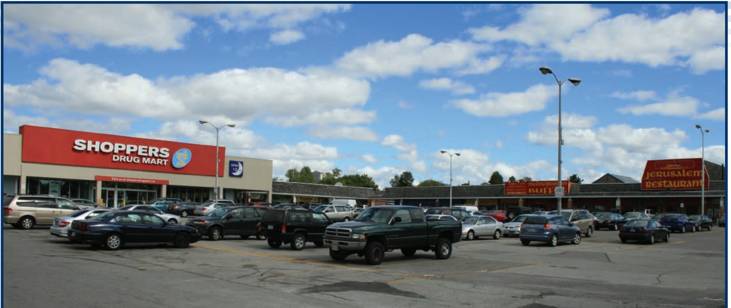
LESLIE NYMARK PLAZA, 4751-4865 Leslie Street, North York, Ontario