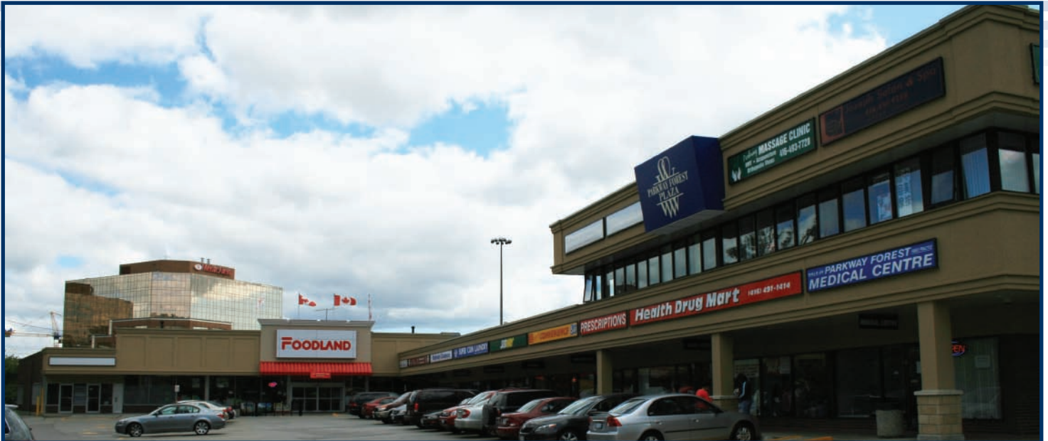
PARKWAY FOREST PLAZA. 103-107 Parkway Forest Drive, North York, Ontario