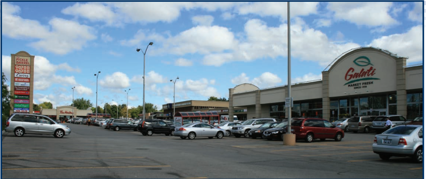
PICKLE BARREL PLAZA, 5845-6015 Leslie Street, North York, Ontario