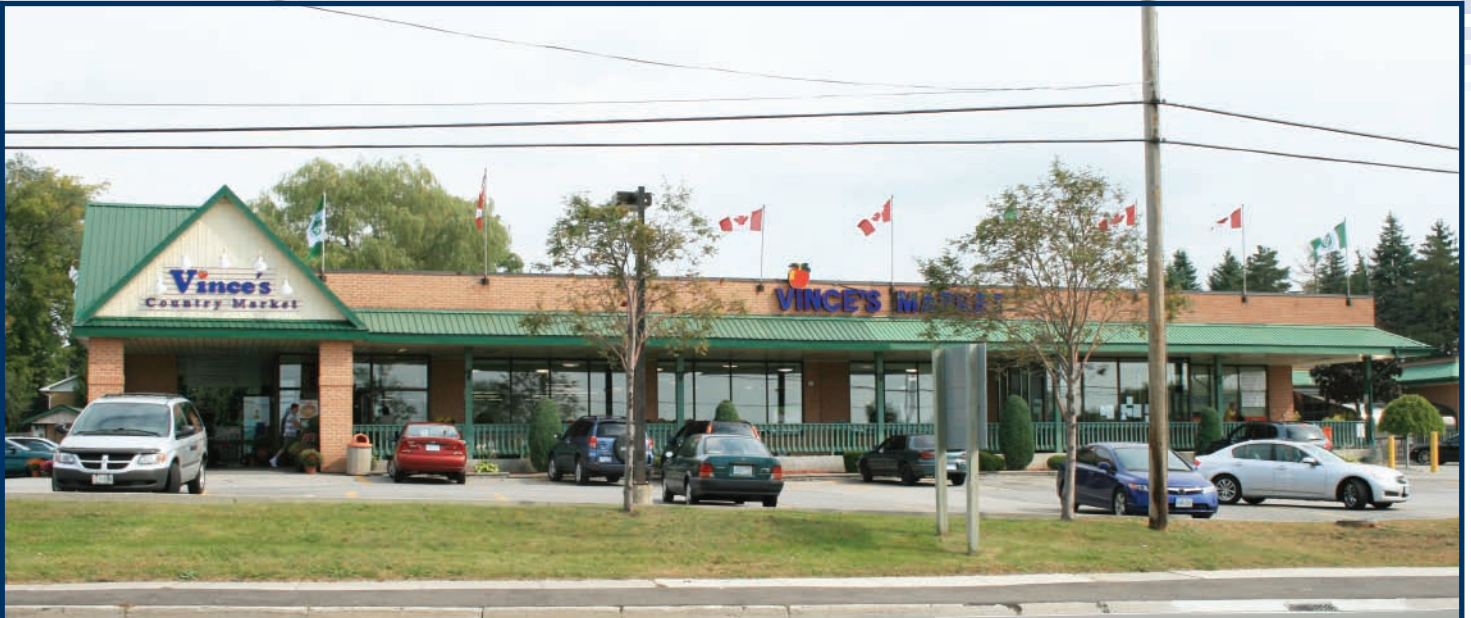
SHARON PLAZA, 19101 Leslie Street, East Gwillimbury, Ontario