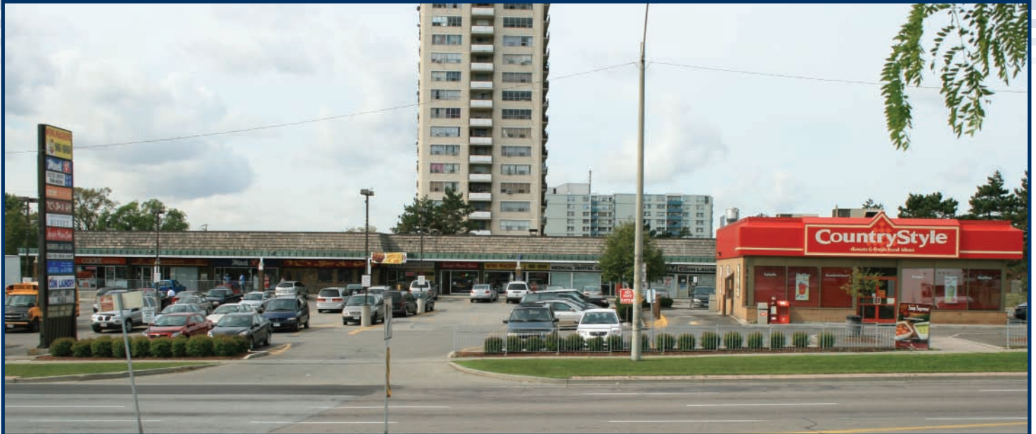
WYCLIFFE JANE PLAZA, 2512-2546 Jane Street, Toronto, Ontario