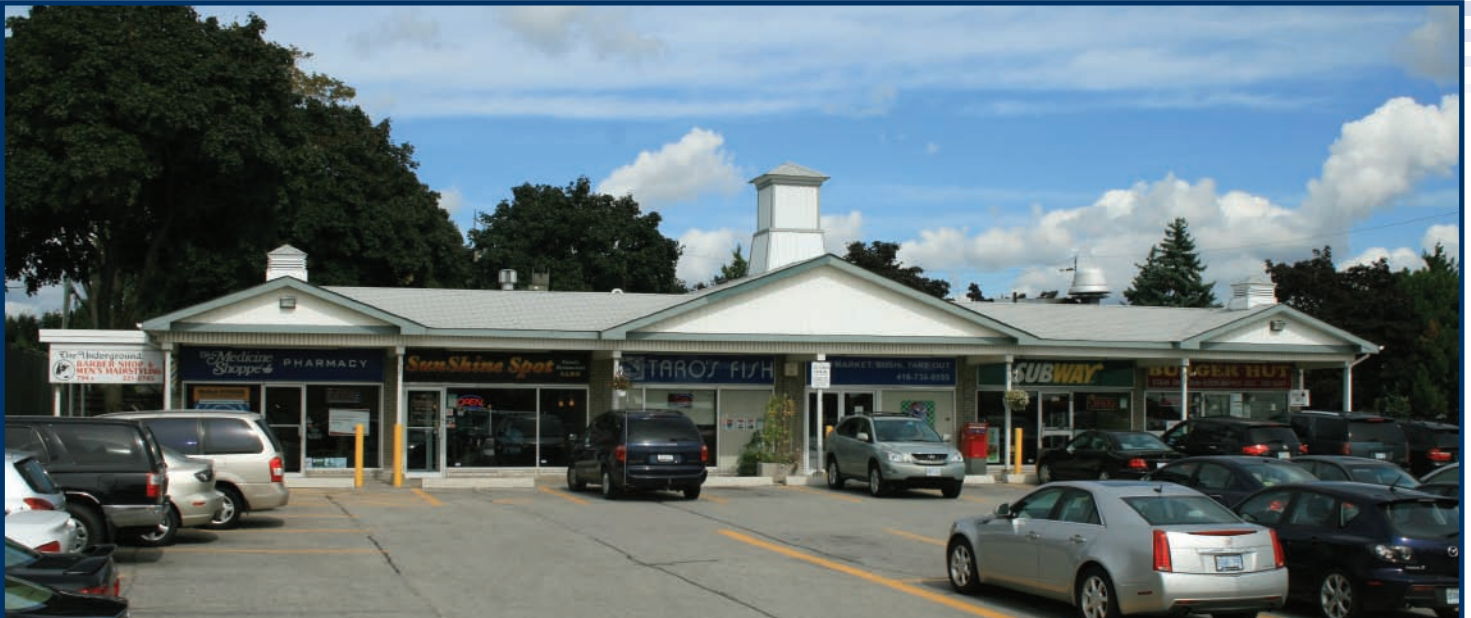
WYCLIFFE SQUARE PLAZA, 794-806 Sheppard Avenue East, North York, Ontario