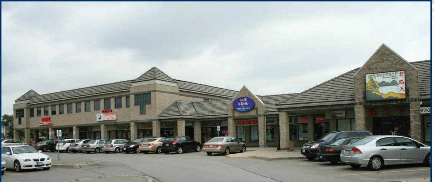
WYCLIFFE VILLAGE, 9019 Bayview Avenue, Richmond Hill, Ontario